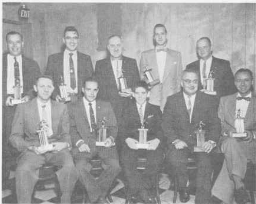
GOODYEAR AIRCRAFT CHAMPIONS OF SECOND ANNUAL G.A.C. TOURNAMENT