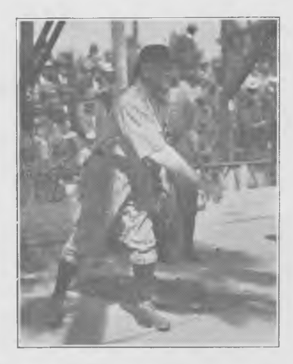
ROGER HORNSBY He abandons baseball for horseshoe pitching frequently