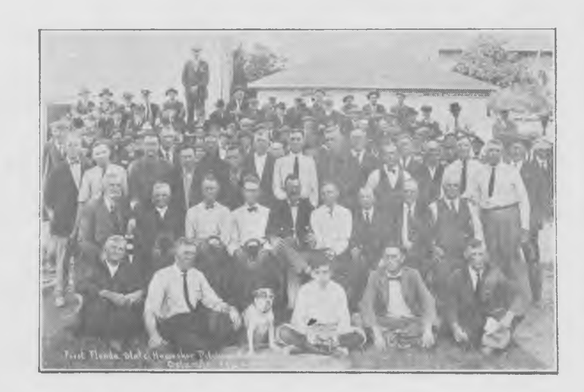
FIRST FLORIDA TOURNAMENT, ORLANDO, FLA.