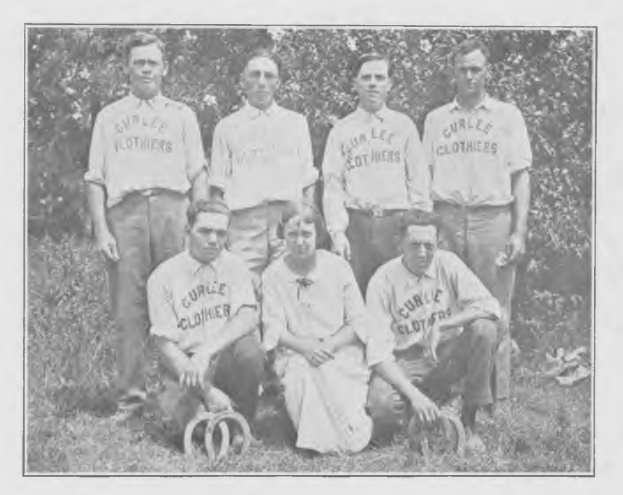
CURLEE CLOTHIERS, ST. LOUIS, MO.