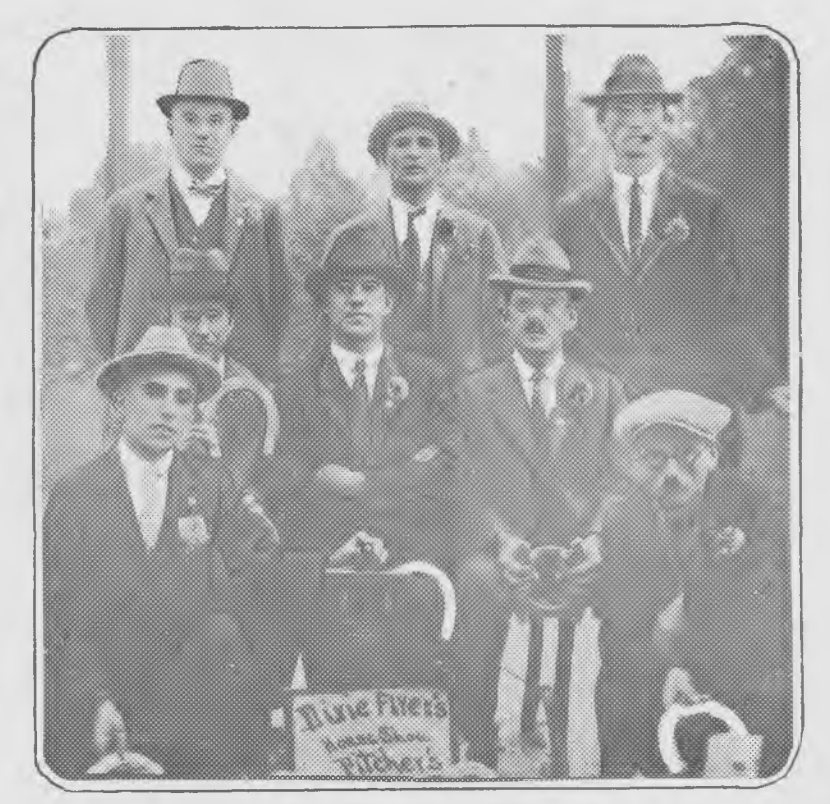
DIXIE FLYERS, LOUISVILLE, KY.