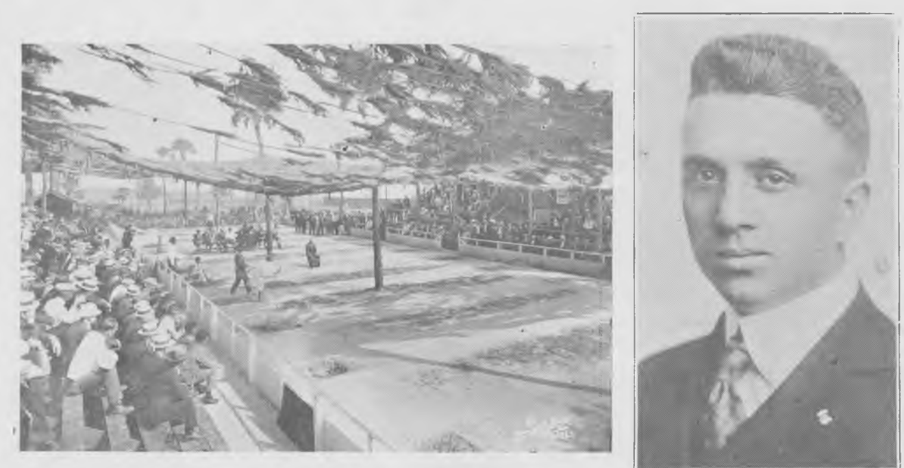
TOURNEY AT ST. PETERSBURG, FLORIDA

TOURNAMENT AT IOWA STATE FAIR, DES MOINES