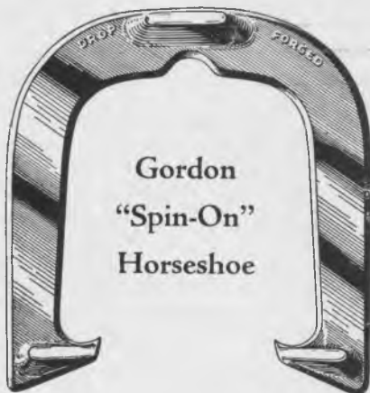
Gordon "Spin-On" Horseshoe

Due to present conditions we decided not to change our 1942 style of Gordon Spin-On. We do not see very well how we can improve it. We think we will have enough material to supply all our present users and others during the entire season. Don't wait too long however.