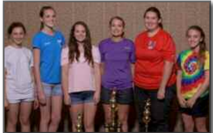
Junior Girls' Championship Class