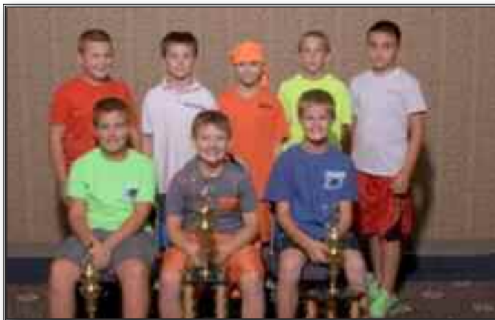
Cadets' Championship Class