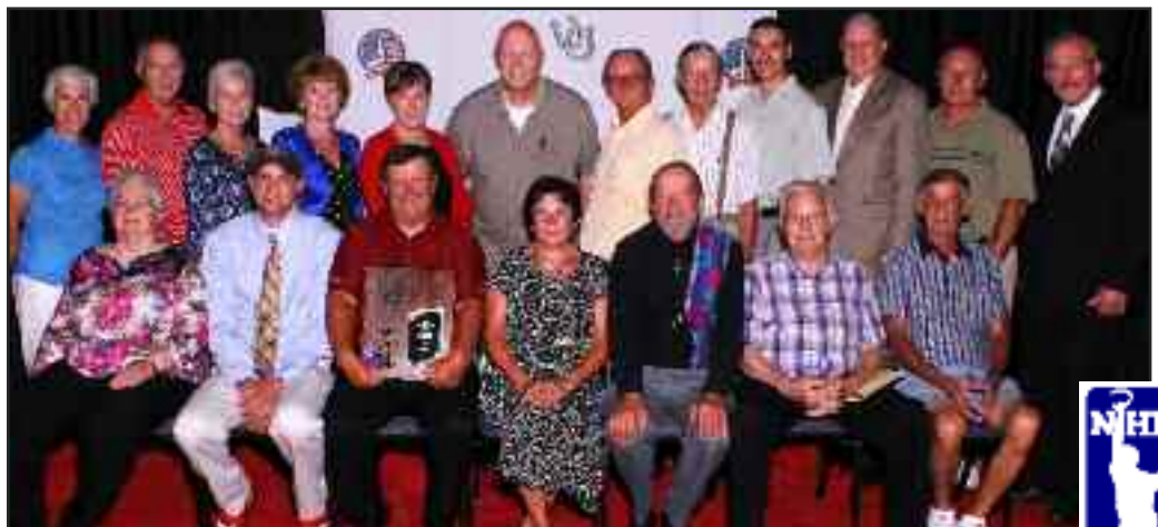
Below, all Hall of Fame members present at the 50th Annual Banquet.

KANSAS LARGEST INCREASE IN CHARTER MEMBERSHIP BY PERCENTAGE 2013 TO 2014: 34.00%