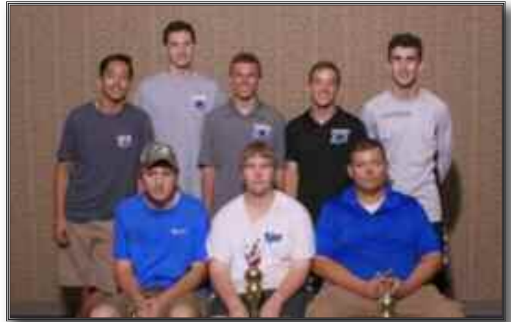
Junior Boys' Championship Class

Throughout the tournament, I heard nothing but praise about the juniors and cadets. They were all on their best behavior and were impressive to watch. The passion they have for this sport is a flame that I hope will never die. The support they receive from fans, parents, and family is overwhelming, and I hope to see each and every one of these 135 young adults, plus more, next year in Alabama!