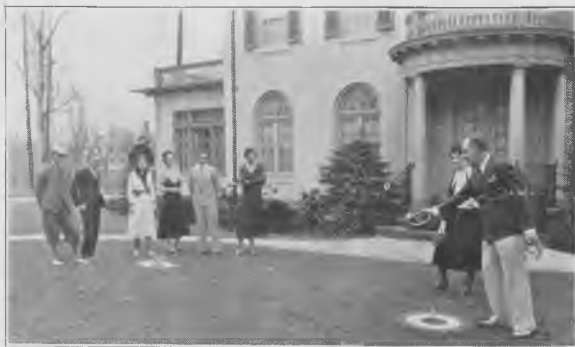
When the warm days come, Shu-Quoi will give you all the thrills of horseshoes, yet it is kind to the lawn. Shu-Quoi is an ideal outdoor game.

A QUOIT GAME that horseshoe pitchers will O. K. and a HORSESHOE GAME that Quoit pitchers will O. K.—