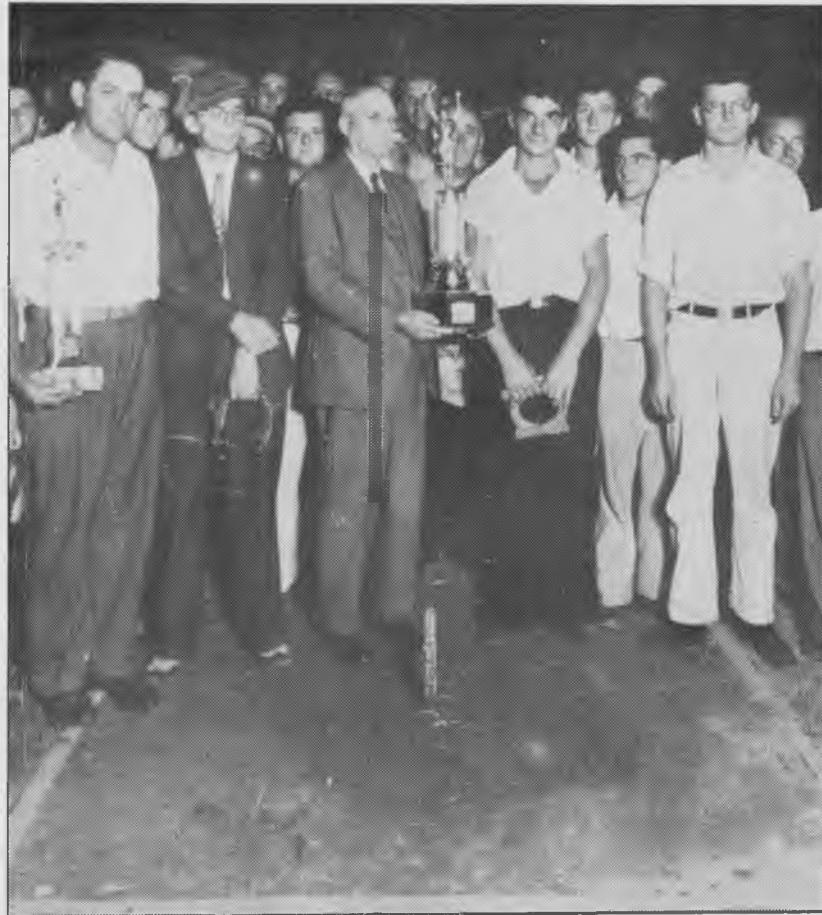
NEW JERSEY TITLE WINNERS