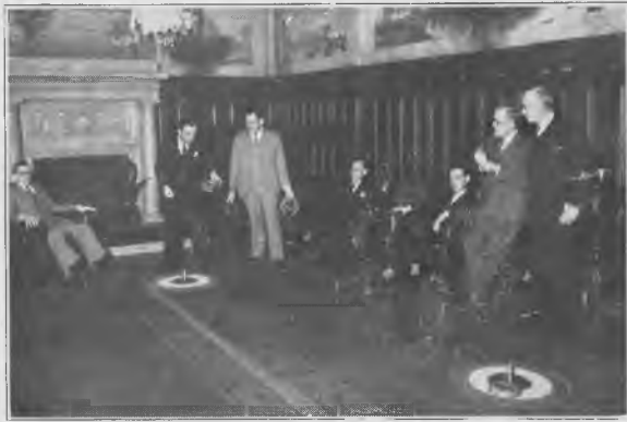
Day or night, rain or shine, now you can always pitch horseshoes. Shu-Quoi is an ideal indoor game.