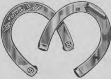
Straight Toe Calk Official Shoe— Made in weights 2 lbs. 5 ozs.; 2 lbs. 6 ozs.; 2 lbs. 7 ozs.; 2½ lbs.