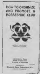
Rule and instruction booklets have valuable information for every player.