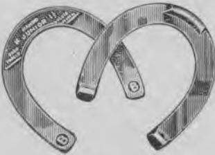
Junior Model, for Ladies and Children— Made in weights 1½ lbs.; 1 lb. 9 ozs.; 1 lb. 10 ozs.; 1 lb. 11 ozs.; 1¾ lbs.