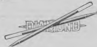
Official steel stakes

Diamond Official Pitching Shoes are made in many styles and weights—all conforming to National Horseshoe Pitching requirements. Either Regular or Dead Falling, straight or curved toe calk (see above) with accessories to make complete indoor or outdoor courts. Score pads and percentage charts make tournaments easy to conduct.