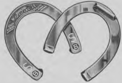
Special Dead Falling Type (Soft Steel)—Made in weights 2 lbs. 5 ozs.; 2 lbs. 6 ozs.; 2 lbs. 7 ozs.; 2½ lbs.