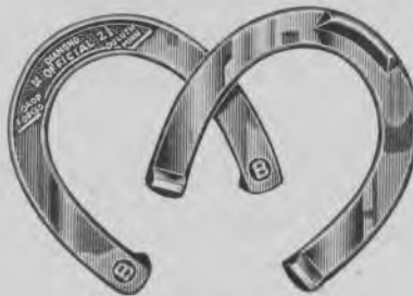
Curved Toe Calk Official Shoe— Made in weights 2 lbs. 5 ozs.; 2 lbs. 6 ozs.; 2 lbs. 7 ozs.; 2½ lbs.