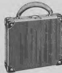
Carrying case; reinforced corners, strong back and sturdy handles.