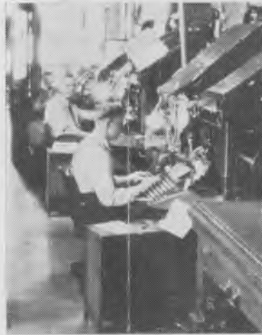
Scene In Horseshoe World Office