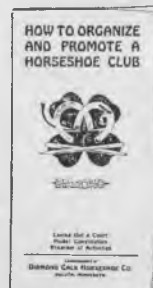
HELPFUL BOOKLETS AND CHARTS

"How to Organize and Promote a Horseshoe Club," a 16-page booklet outlining complete procedure of activities. "How to Play Horseshoe" gives latest official rules. Free with orders for Diamond Shoes. Chart comes in book with 25 score sheets. Each sheet made for 25 innings—percentage chart for ringers and double ringers.