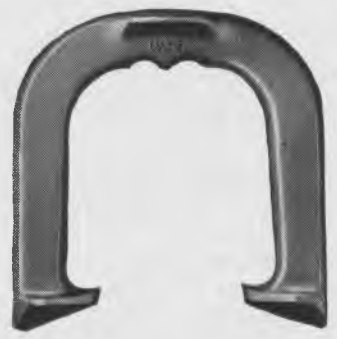
You too can make records with OHIO horseshoe. A trial will convince you.

(Longer Calks which make them stick better)